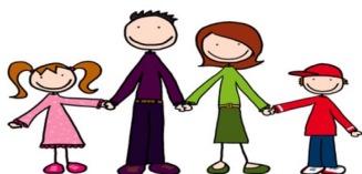
MISS MY FAMILY