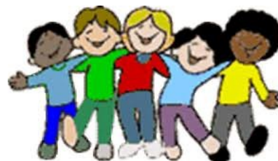
BEING WITH FRIENDS